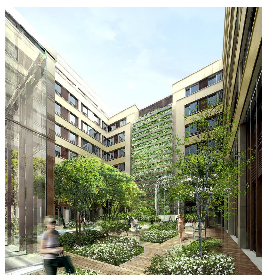
Courtyard of the Mandarin Oriental Hotel in Paris (artist's impression)

With an exceptional portfolio of properties valued at nearly €3.1 billion including transfer costs, essentially located in the Paris Central Business District, SFL is a preferred vehicle for investors wishing to invest in the Paris office and retail property market. As the leading player in this market, the Group is firmly focused pro-actively on managing high-quality property assets. SFL has elected to be taxed as an SIIC since 2003.